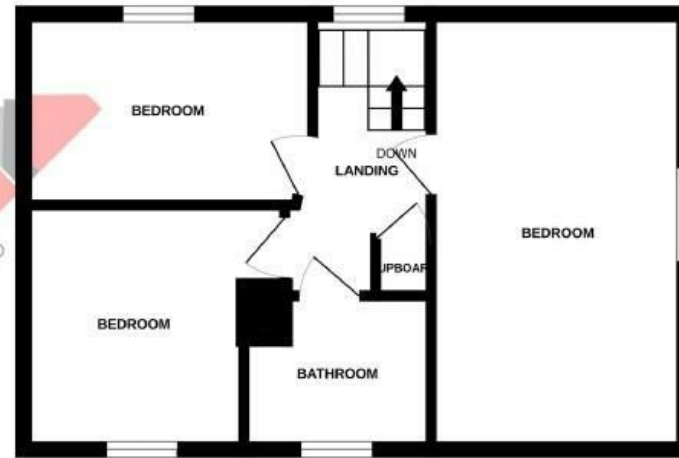
1ST FLOOR 358 sq.ft. (33.3 sq.m.) approx.